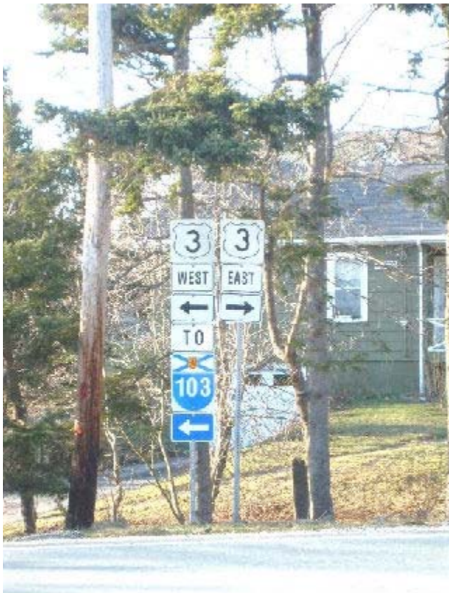
Close to Everything