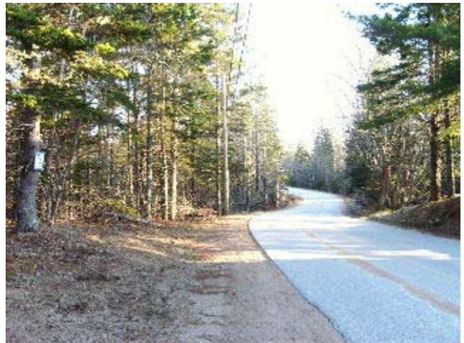
Property on Left