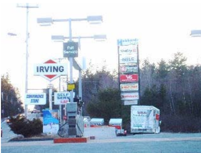
Shopping, Gas Etc.