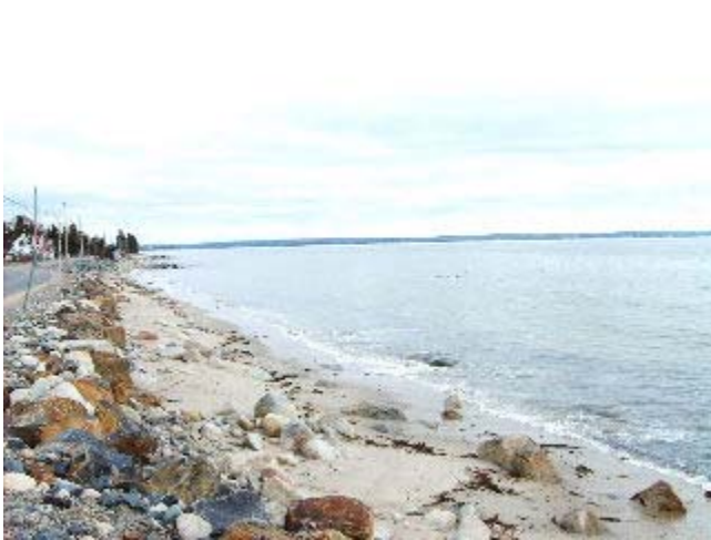
Queensland Beach 3