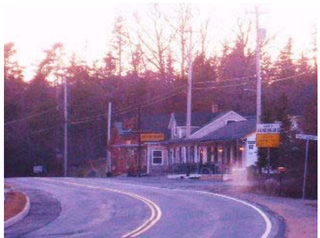
Restaurant & Shopping