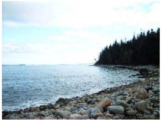
Queensland Beach 2