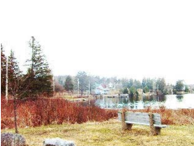
Conrads Rd View 2